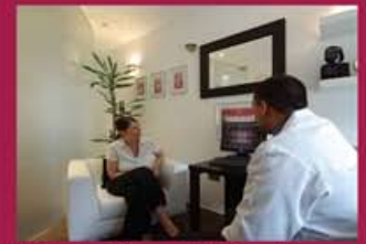
Private Consultation Room

What are you waiting for, call us on 01707 261367 to book your free smile assessment and see if any of these methods are suitable for you. For any special offers please refer to www.aesthetics-dentistry.com