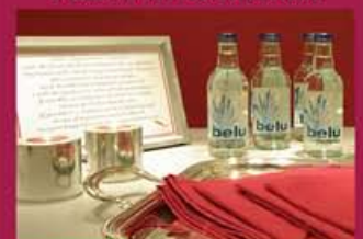
Hot & cold Refreshments Available