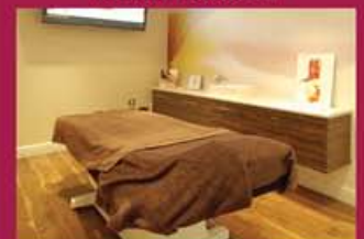
aesthetics Spa Studio