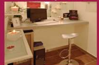
Free Wifi & Internet