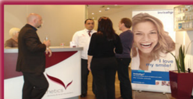
Invisalign Open Evening at aesthetics