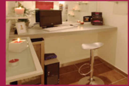
Free Wifi & Internet