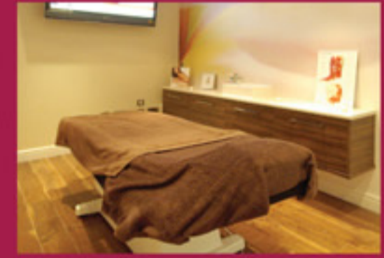
aesthetics Spa Studio