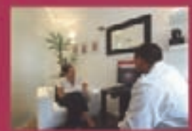
Private Consultation Room