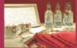
Hot & cold Refreshments Available