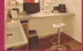
Free Wifi & Internet