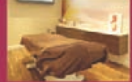
aesthetics Spa Studio